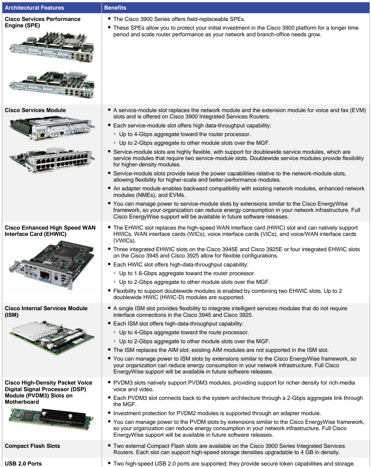
Table 3. Modularity Features and Benefits